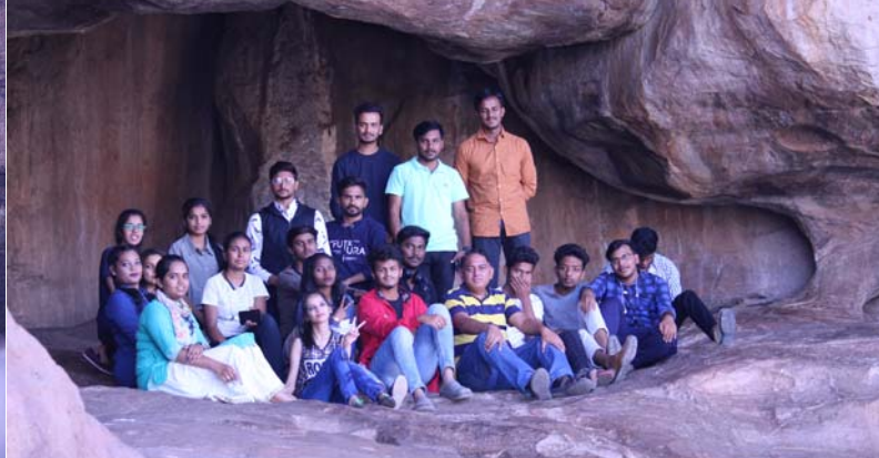
The tour also made an evidence to visit near by historical places like Badami and Pattadakal